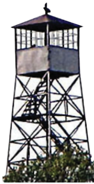
Fire Tower 60' high elev. at base 2405'

Find Your Adventure! Discover • Explore • Connect