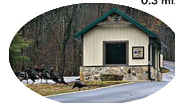
To Gate House Entrance 0.3 mi. Start/End Eastman Forest Walk elev. 1400' 0.7 mi.

853 Bays Mountain Park Road Kingsport, TN 37660 www.baysmountain.com (423) 229-9447